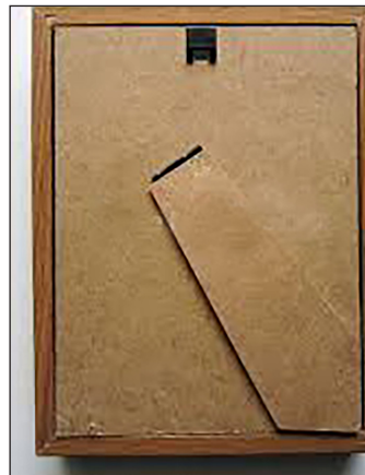
Table top frames not strong enough for hanging & will not work with hanging system at Satellite Gallery